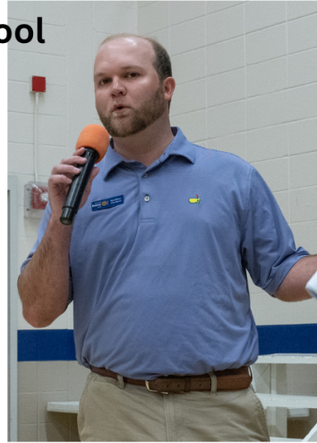
Comedy for a Cause