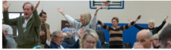
Dancing to Get the Meeting Started